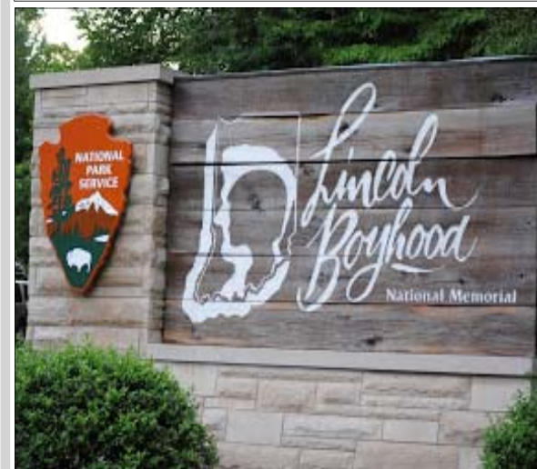
National Park Service's Lincoln Boyhood National Memorial entrance, Indiana.