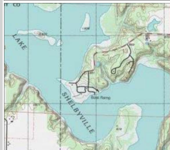
Wilborn Creek Recreation Area