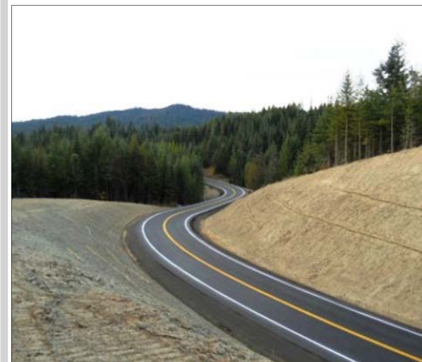
Grangemont Road, Clearwater County, Idaho