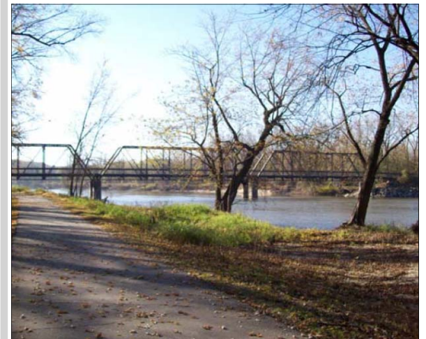
Scenic View of the river and historic InterUrban Trail Bridge from the Neal Smith Trail