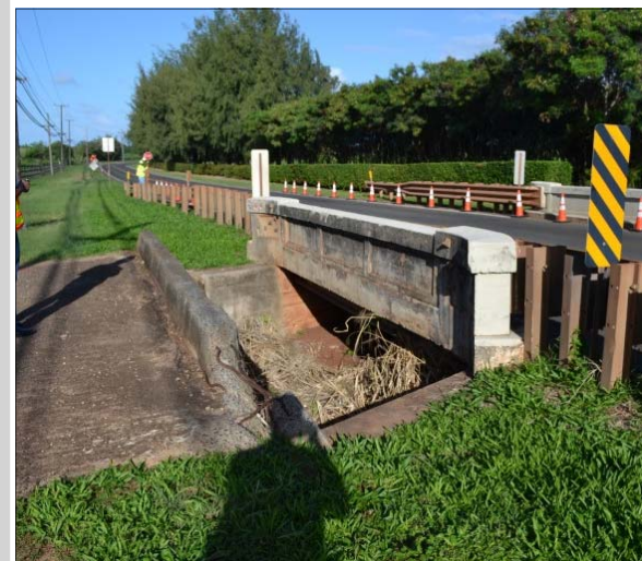
Hoolapa Bridge, Pre-Construction