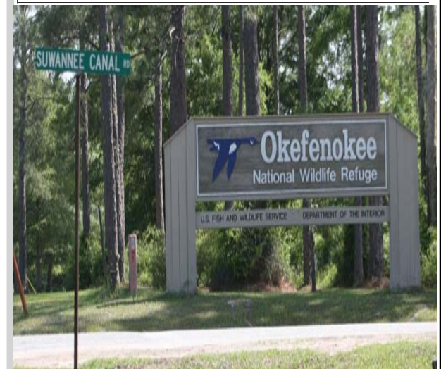
Okefenokee National Wildlife Refuge, Georgia