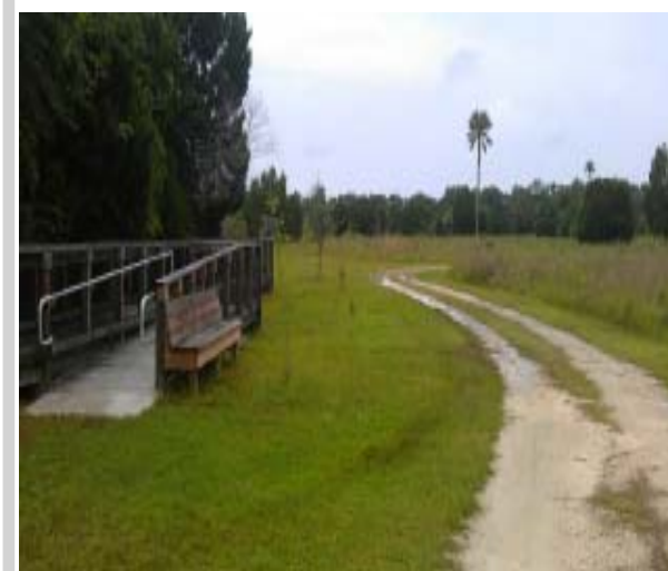
Existing administrative road and new visitor facilities at Three Sisters Springs, Florida