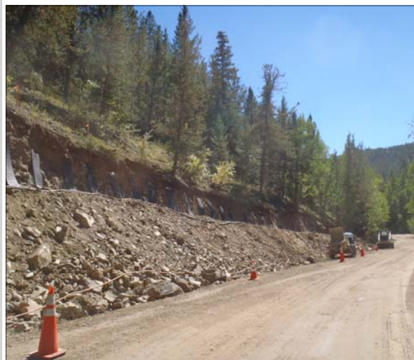
Guanella Pass Road, Pre-Construction