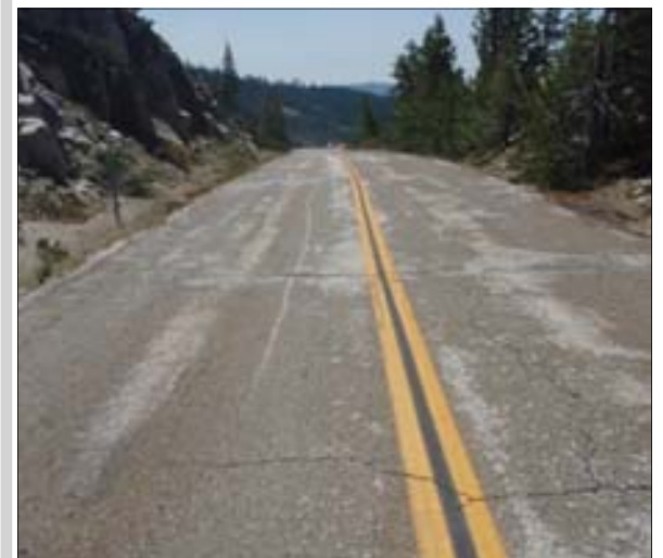
Ice House Road, Pre-Construction