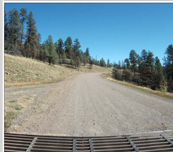
Three Forks Road, Pre-Construction