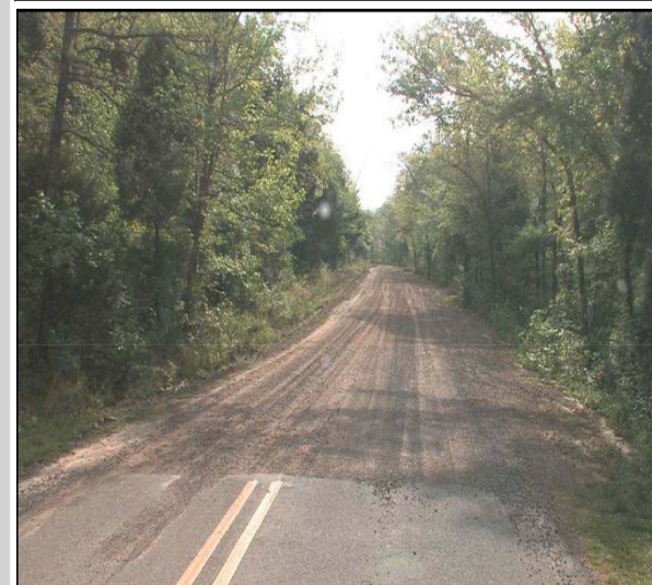
Highway 220 Crawford County, Arkansas