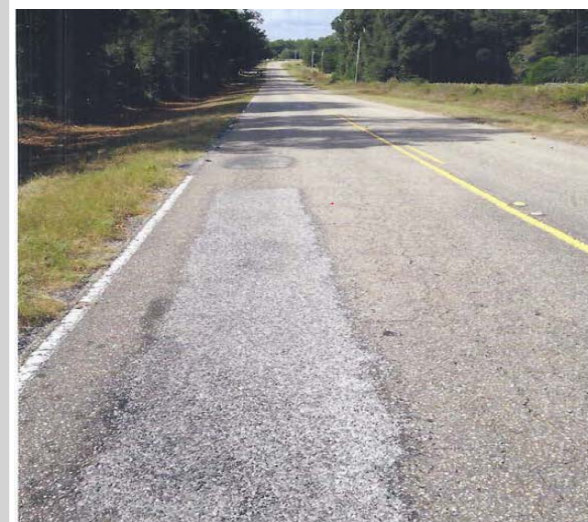
County Rd 700 surface, City of Enterprise, Alabama