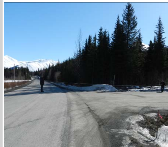
Snug Harbor Road, Kenai Peninsula Borough, Alaska