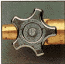
New OPD handwheel

(Each manufacturer has their own style.)