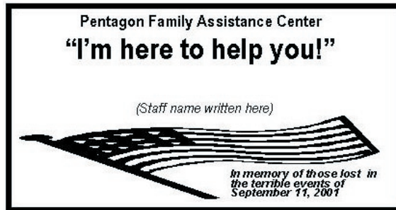
This is a facsimile of the name tag used in the PFAC for all staff members