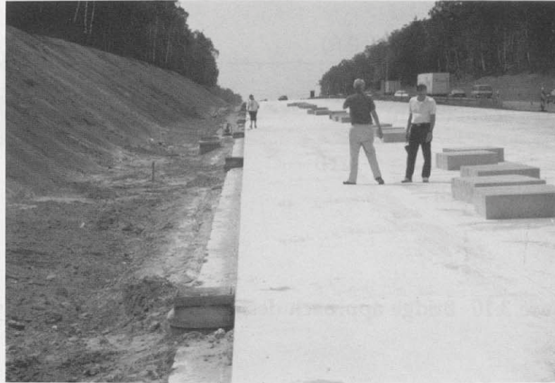
Figure 3.9 Construction site on the A10 south of Berlin showing catch basins at edge of slab that are connected to longitudinal pipe under the lean concrete base and connected to the manhole shown on the left.

Bridge Ends: End lug is placed more than 15 m (49 ft) from backwall of structure and then an AC surface over a CTB are placed to the backwall, as shown in Figure 3.10.