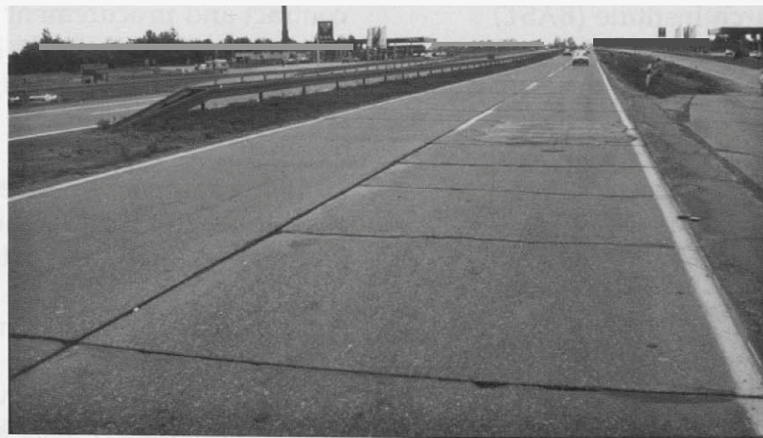
Figure 3.8 Photo of a 1930's German autobahn concrete pavement near Berlin. (Note cracking in outer truck lane of the 12-m (39-ft) slabs.)

A photograph of a 50-year-old (1930's) jointed concrete pavement section on the autobahn approaching Berlin from Munich is shown in Figure 3.8. These were the divided controlled-access highways that impressed many Americans returning from World War II, including President Eisenhower, to sponsor the development of the USA Interstate highway system.