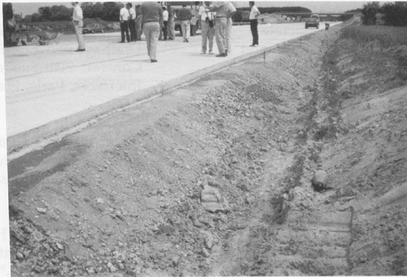
Figure 3.12 Thick granular blanket placed beneath lean concrete base in Germany.

Subbase: A granular layer exceeding 30 cm (11.8 in) was placed directly on the subgrade. Figure 3.12 shows the thick granular layer placed beneath the lean concrete base.