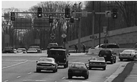
Confusing Signal Displays

To check this possibility, it is recommended that the investigator drive through the intersection and note on each approach whether or not there is visual clutter. In doing so, the inspector should try to imagine how a driver unfamiliar with the area would view the scene. The inspection can be done during the day, and then, if there is reason to believe that nighttime would be more severe, a night inspection should be made as well. If it is believed that the visual clutter could detract from clearly seeing the signal, circle yes .