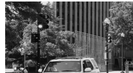
Conflicting Signal Displays

Intersections with more than four approach legs and those with approaches at non-90 degree angles frequently experience a situation where the signal displays for other approaches can be seen from the approach being investigated. If not properly shielded with visors, this can cause driver confusion and some drivers may misinterpret the signal display for the appropriate approach. Indicate if this situation exists and if yes, mark whether visors, shields, or programmable lenses are being used. Check each lane on the approach.