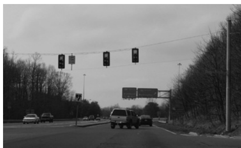
Span Wire Mounting