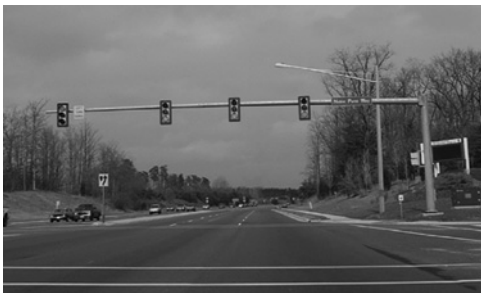
Mast Arm Mounting