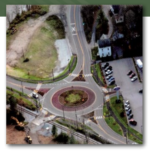
Figure 1: Overhead photo of the second roundabout completed in Montpelier.

In addition, this roundabout has improved safety, reducing speeds at the intersection of Main and Spring Streets, and providing more favorable crossing conditions for pedestrians. Officials at the middle school affected by the roundabout have said that the intersection is much safer after the construction. Prior to construction, a limited number of pedestrians traversed the intersection, but after the roundabout construction, a large number of students use the route on their way to and from school (30-50 in the mornings and 150 in the afternoons).