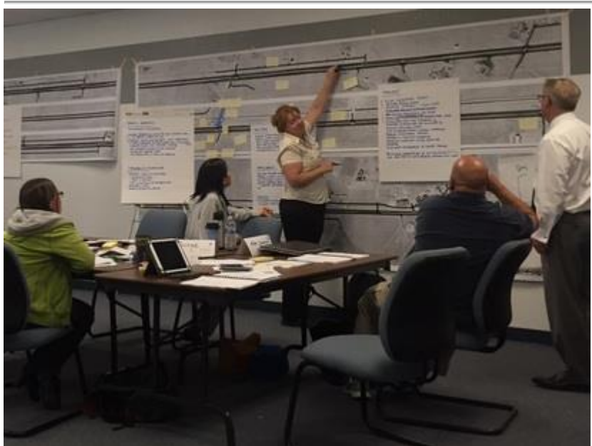
A Master Trainer observes an instructor for certification teaching a Value Engineering Course in Carson City, Nevada.