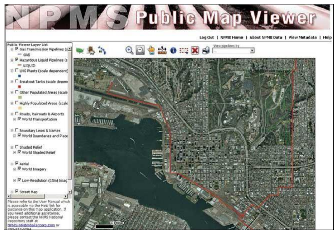
Screen shot: National Pipeline Mapping System, Public Map Viewer(https://www.npms.phmsa.dot.gov/)