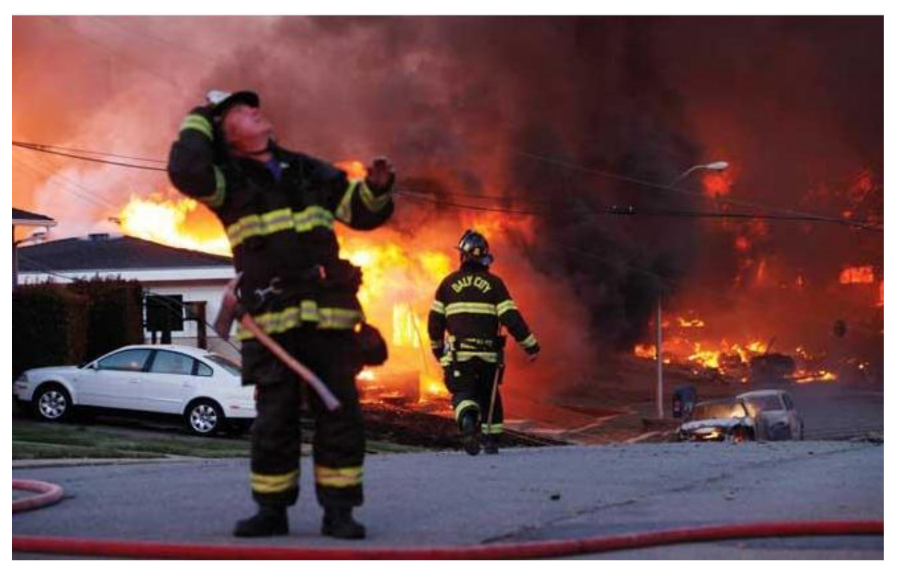
A massive fire roars through a mostly residential neighborhood in San Bruno, Calif., following a pipeline explosion that killed eight people and incinerated the neighborhood.

Despite these facts, several recent pipeline incidents have highlighted the need for communities to be adequately prepared for pipeline emergencies. In September 2010, a gas pipeline rupture and the subsequent ignition in San Bruno, Calif., caused eight fatalities, injuries to more than 60 people, the complete destruction of 38 homes, and damage to 70 other homes. An investigation of the incident revealed that the local emergency responders were not adequately prepared to respond to the pipeline emergency.