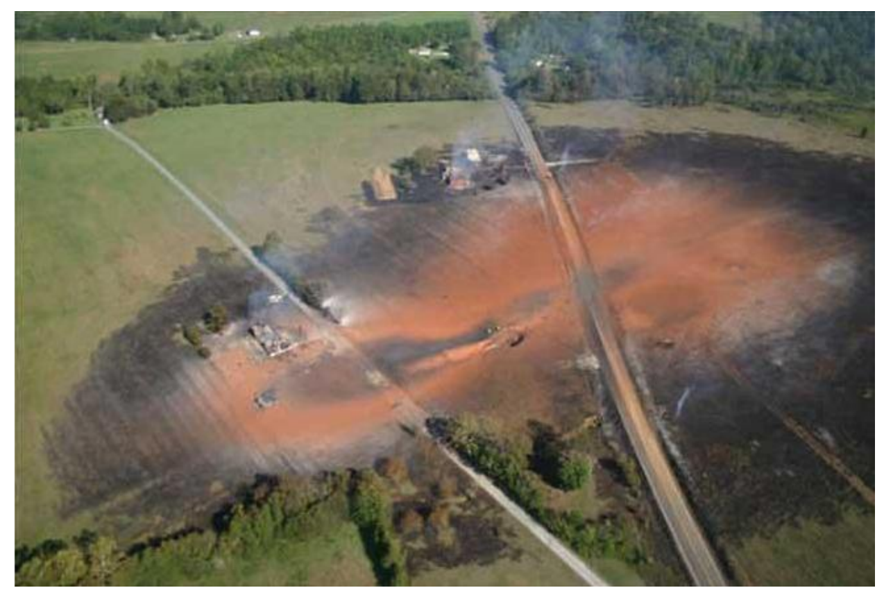
An aerial view of the impact of a natural gas pipeline rupture and fire in Appomattox, Va., in 2008, that demolished two houses and damaged buildings 400 yards away.