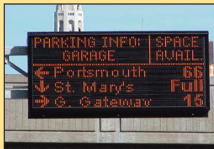
SF Park Parking Information Sign

Dynamically managing parking can affect travel demand by influencing trip timing choices, mode choice, as well as parking facility choice at the end of the trip. This ATDM approach can also have a positive impact on localized traffic flow by providing real-time parking information to users and ensuring the availability of spaces to reduce circling around parking