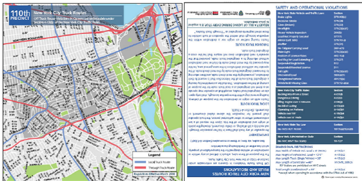
Figure 6: Sample Truck Route Memo Insert

Source: New York City Truck Route, 110th Precinct