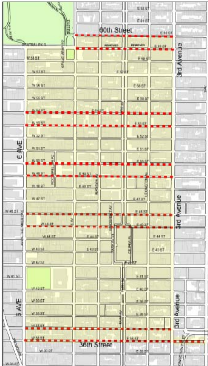
Figure 4: THRU Streets Area Map