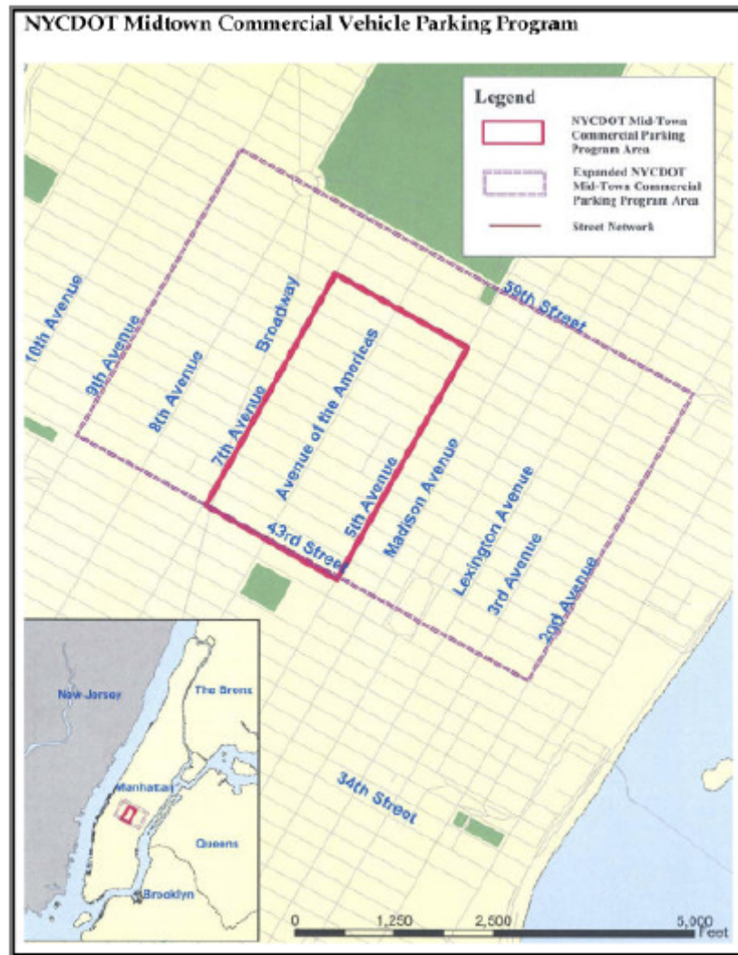
Figure 2: NYCDOT Midtown Commercial Vehicle Parking Program