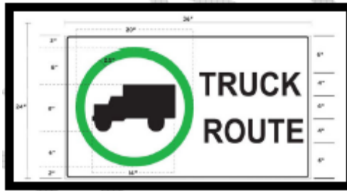
Figure 5: Sample Positive Truck Route Sign