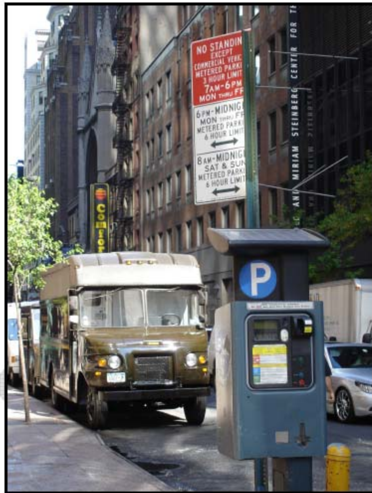
Figure 3: Muni-meter on New York City Street