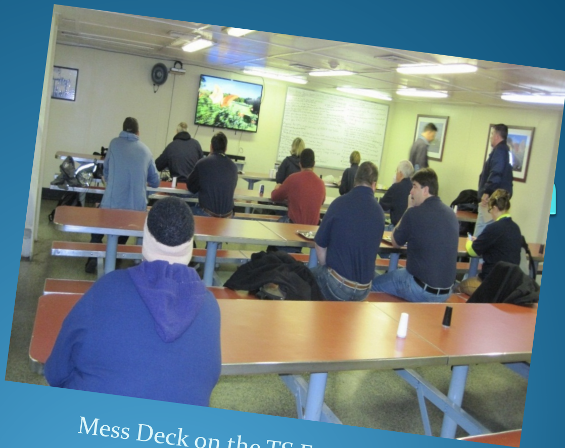
Mess Deck on the TS Empire State