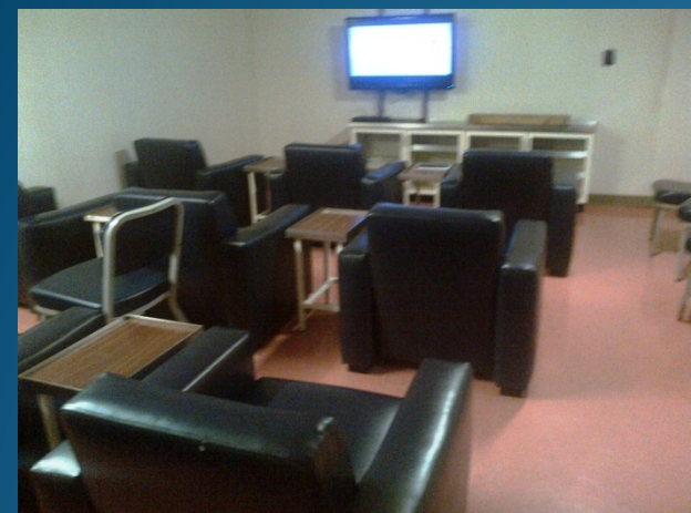
TV Lounge on TS Kennedy