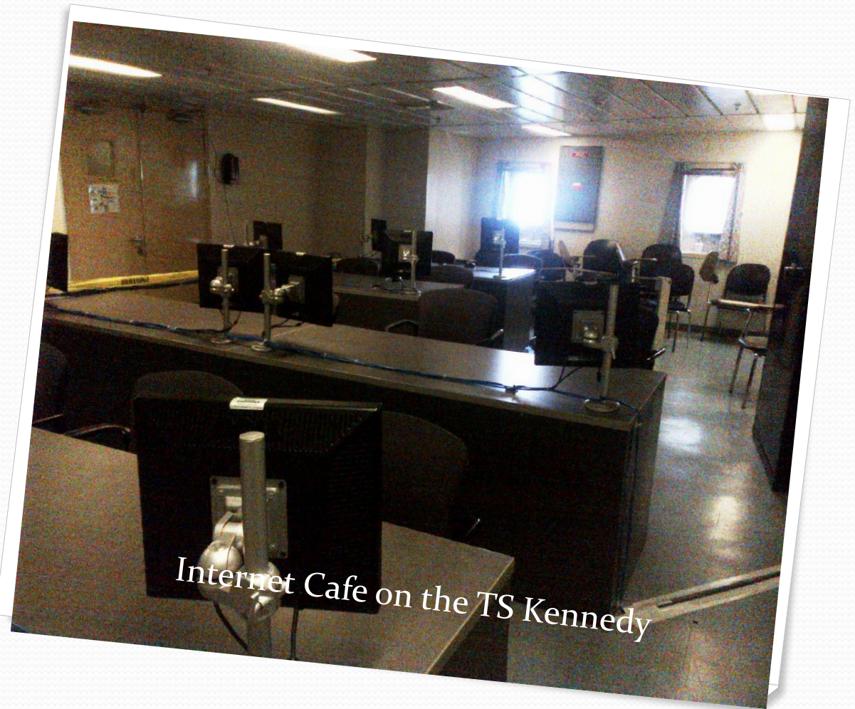
Internet Cafe on the TS Kennedy