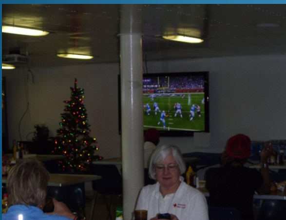
Mess Deck on the SS Wright