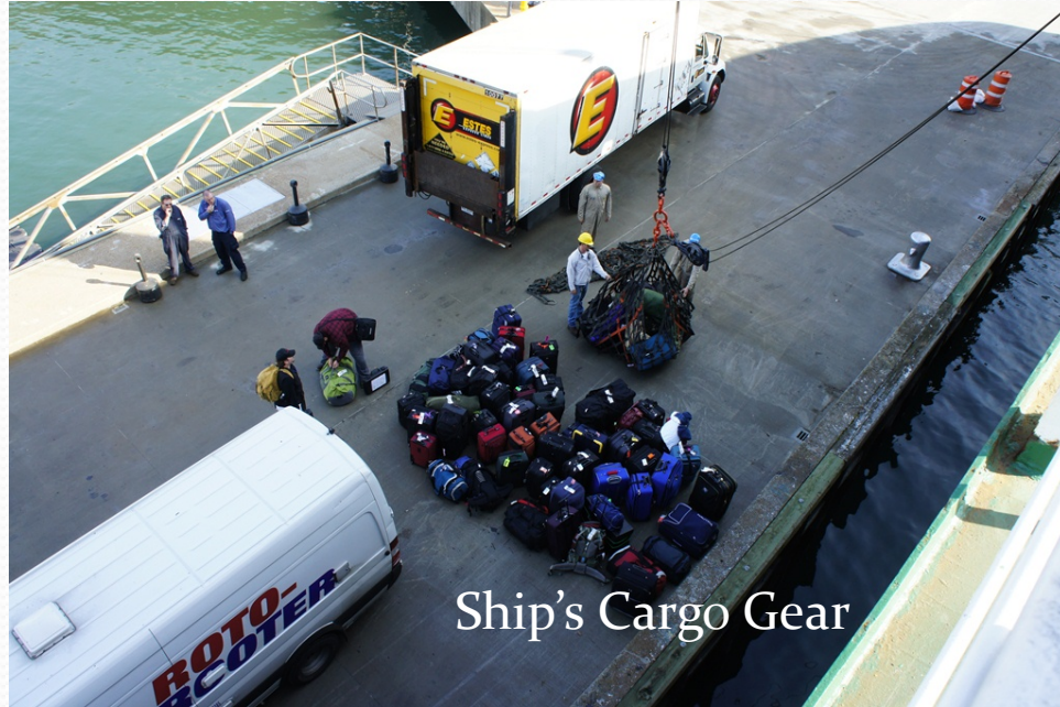
Ship's Cargo Gear