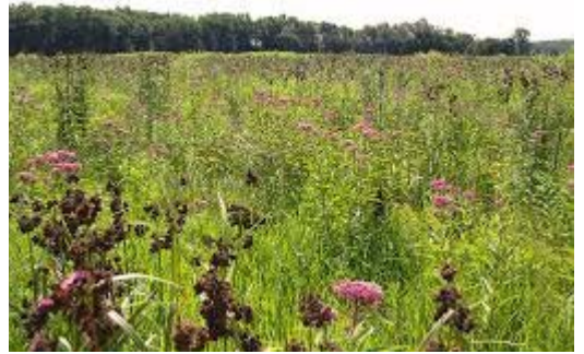
Preserved wetland in Michigan.

Over thirty years have passed since MDOT first signed a Memorandum of Understanding (MOU) with MDEQ in 1985 to prioritize, support, and expedite wetlands permitting on transportation projects across the State. Fifteen years ago, the newsletter highlighted the importance of MDOT's relationships with MDEQ, as well as the FHWA Michigan Division Office, the County Road Association (CRA) of Michigan, and the Michigan Municipal League (MML). Together, these agencies implemented a customized Section 404 permitting program that meets the specific needs of Michigan projects through approaches that may not be available under a strictly Federal permitting process. Michigan and New Jersey are the only States that have wetlands permitting authority instead of the Federal government.