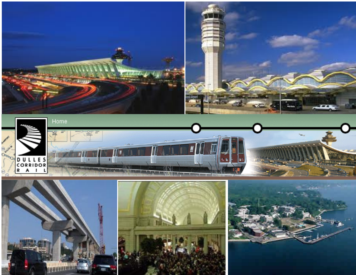
Source (from top left to bottom right): Dulles International Airport, Reagan National Airport, Dulles Corridor Rail, Dulles Corridor—Phase 2, Union Station, and United States Merchant Marine Academy.

The Department owns or invests in several key transportation assets. These include the Metropolitan Washington Airports Authority (MWAA), which operates the region's two largest airports 13 —Ronald Reagan Washington National and Dulles International—and is also responsible for a massive public transportation expansion; Union Station, the main multi-modal transportation hub in Washington, DC; and the United States Merchant Marine Academy (the Academy) in New York. We have recent and ongoing work evaluating DOT's management practices for these critical assets due to recent concerns raised by Congress or other stakeholders to our office. Our audits highlight the need for the Department to improve its oversight of these assets to ensure their success and sustainability.