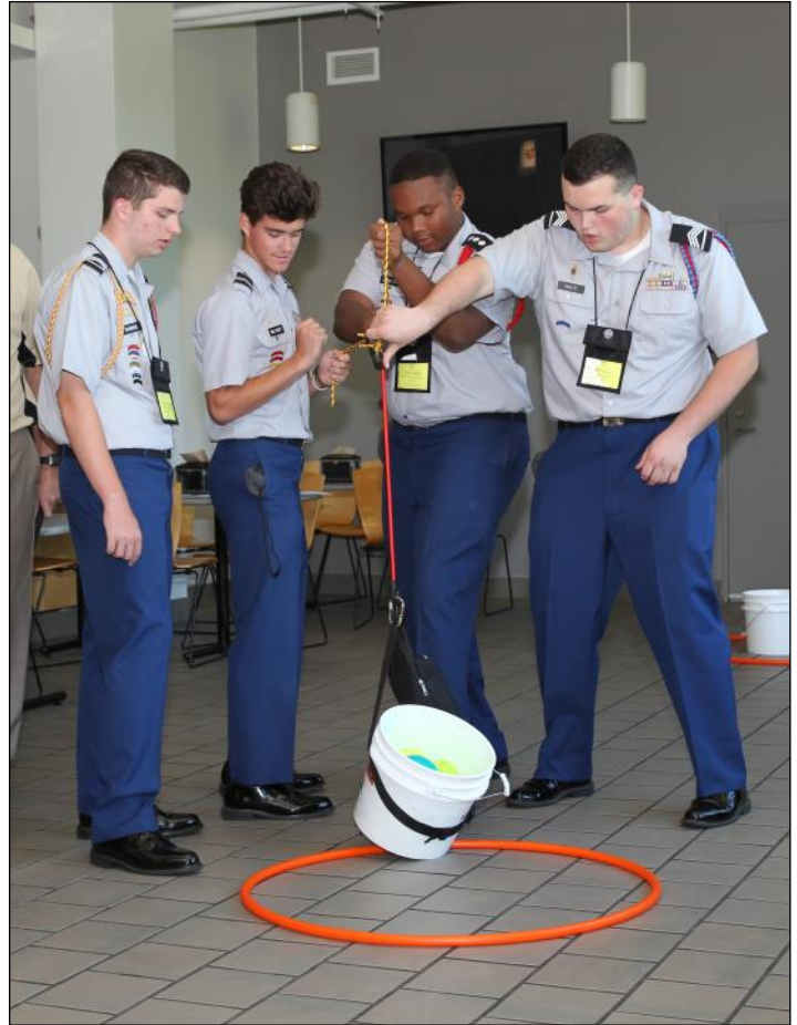
Cadets from Claudia Taylor Johnson High School, San Antonio, work together to move "toxic waste" from one location to another at one of the stations in the Leadership Challenge during JLAB 2016.