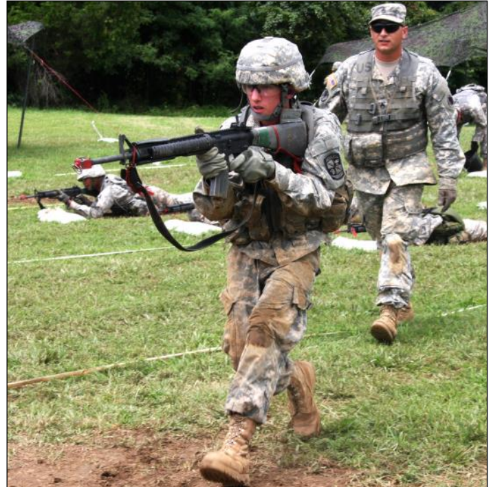
A Bravo Company, 7th Regiment Basic Camp (CIET) Cadet advances to the next station on the Hand Grenade Assault Course at Fort Knox, Ky. July 29.

He identified the three leader attributes most important for future officers of the U.S. Army as: agility in thought, adaptive critical thinking and problem solving, and an ability to show innovation in their leadership. He also outlined his three main goals as the new commander.