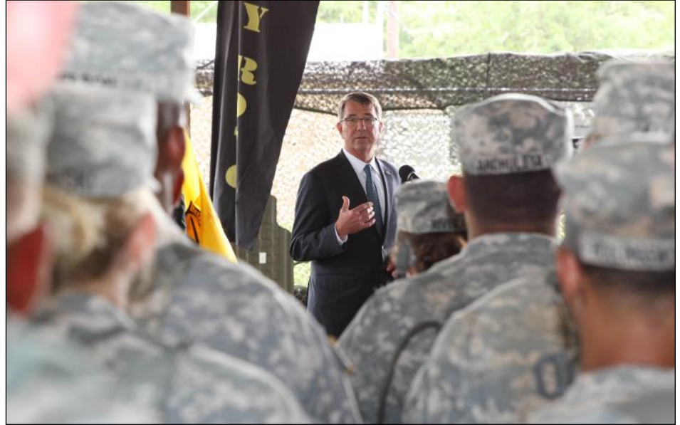
Secretary of Defense Ash Carter speaks to Cadet Summer Training Cadets during his visit to Fort Knox June 22.

“What we are prioritizing in the Army at the moment is readiness. You