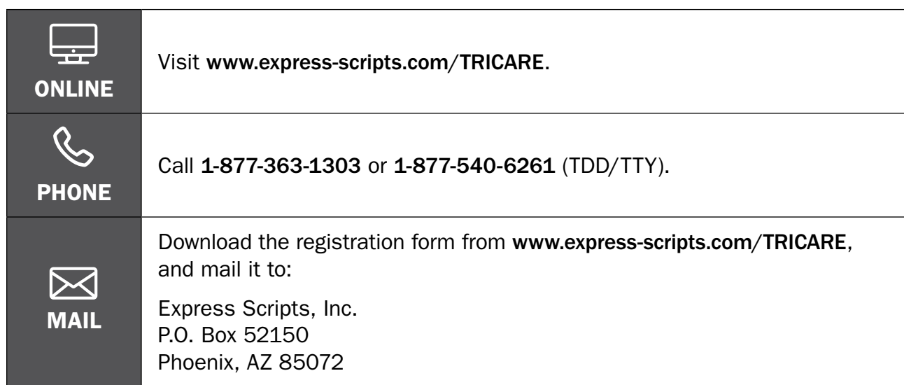
Figure 4.1 TRICARE Pharmacy Home Delivery Registration Methods

When visiting non-network pharmacies, you pay the full price of your medication up front and file a claim to get money back. Claims are subject to deductibles, out-of-network cost-shares and TRICARE-required copayments. All deductibles must be met before you can get money back. For details about filing a claim, see the Claims section of this handbook.