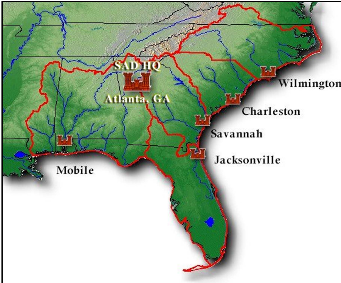
Figure 1. South Atlantic Division's District office regions