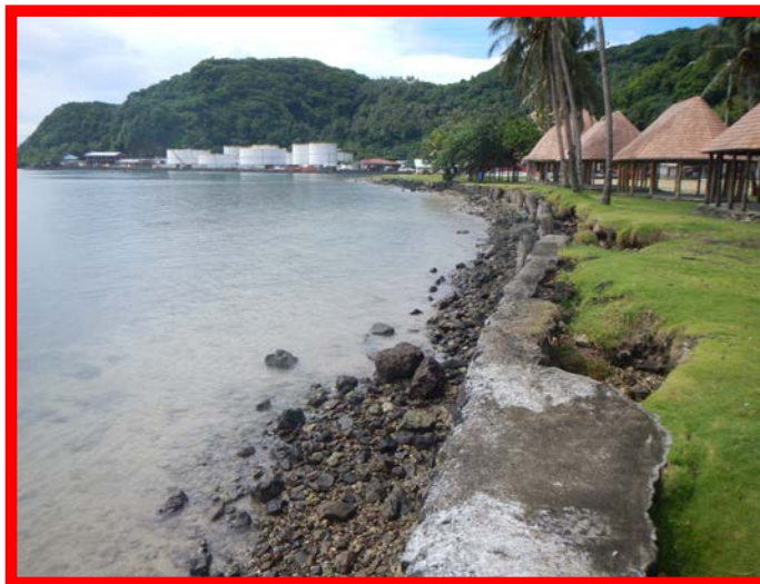
Figure 2: View of the Utulei Beach shoreline looking towards the south.