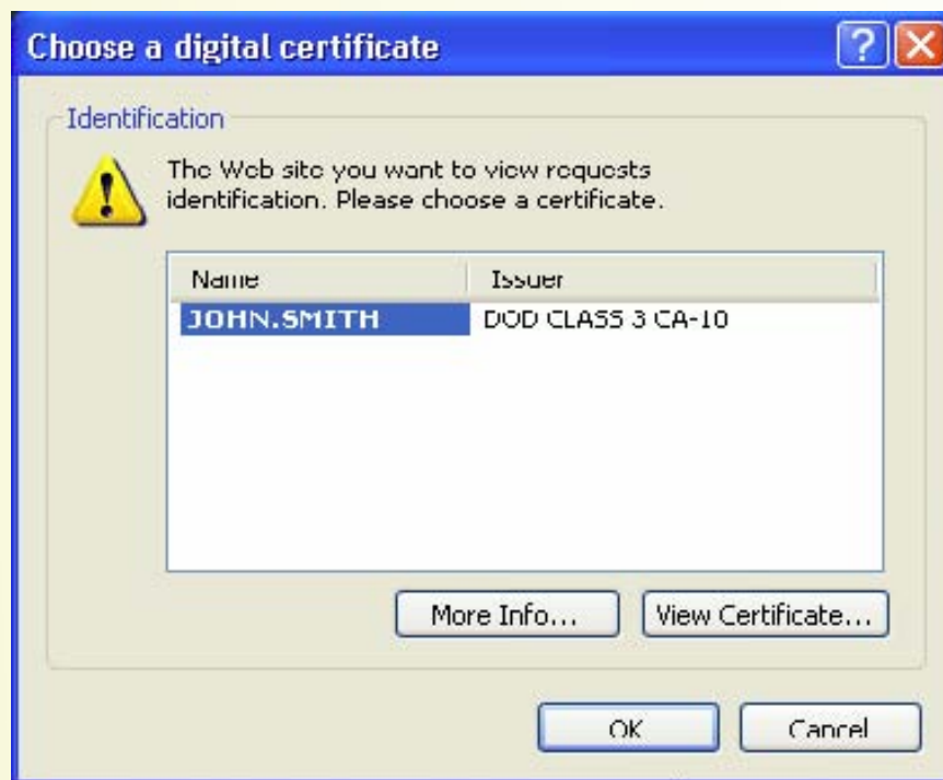
Figure 2: Choose a Digital Certificate