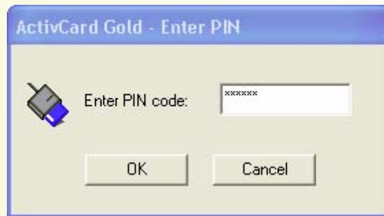
Figure 3: CAC Reader Software - Enter PIN dialog box