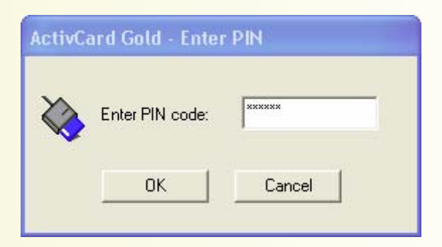
Figure 3: CAC Reader Software - Enter PIN dialog box

8. The CAC Reader Software – Enter PIN dialog box opens (see Figure 3). Enter your PIN (Personal Identification Number) and click the OK button.