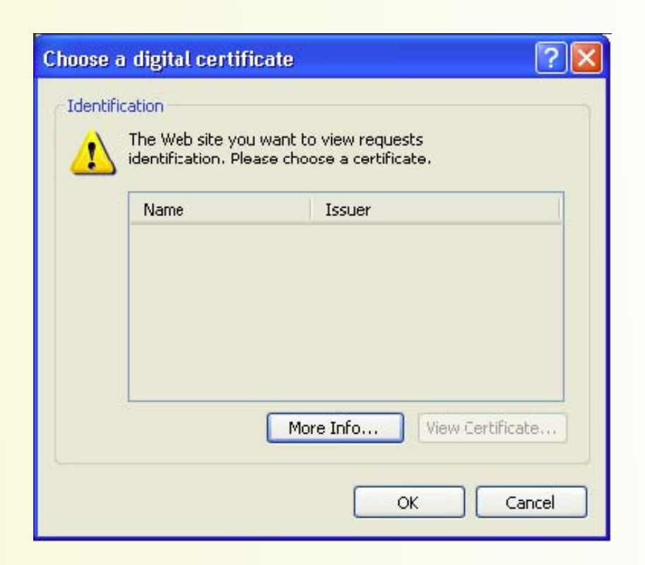
Figure 1: Missing Client Certificate