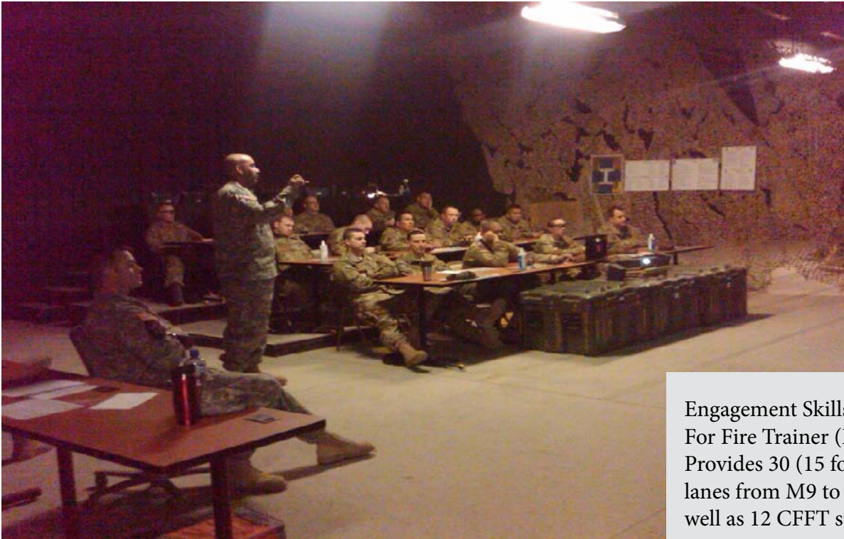
Engagement Skills Trainer/Call For Fire Trainer (EST/CFFT) Provides 30 (15 for M4, 15 CSW) lanes from M9 to M2 and AT4 as well as 12 CFFT stations.