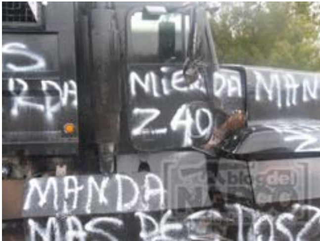
http://www.blogdelnarco.com/2010/07/es- ... de_04.html Link is dead.