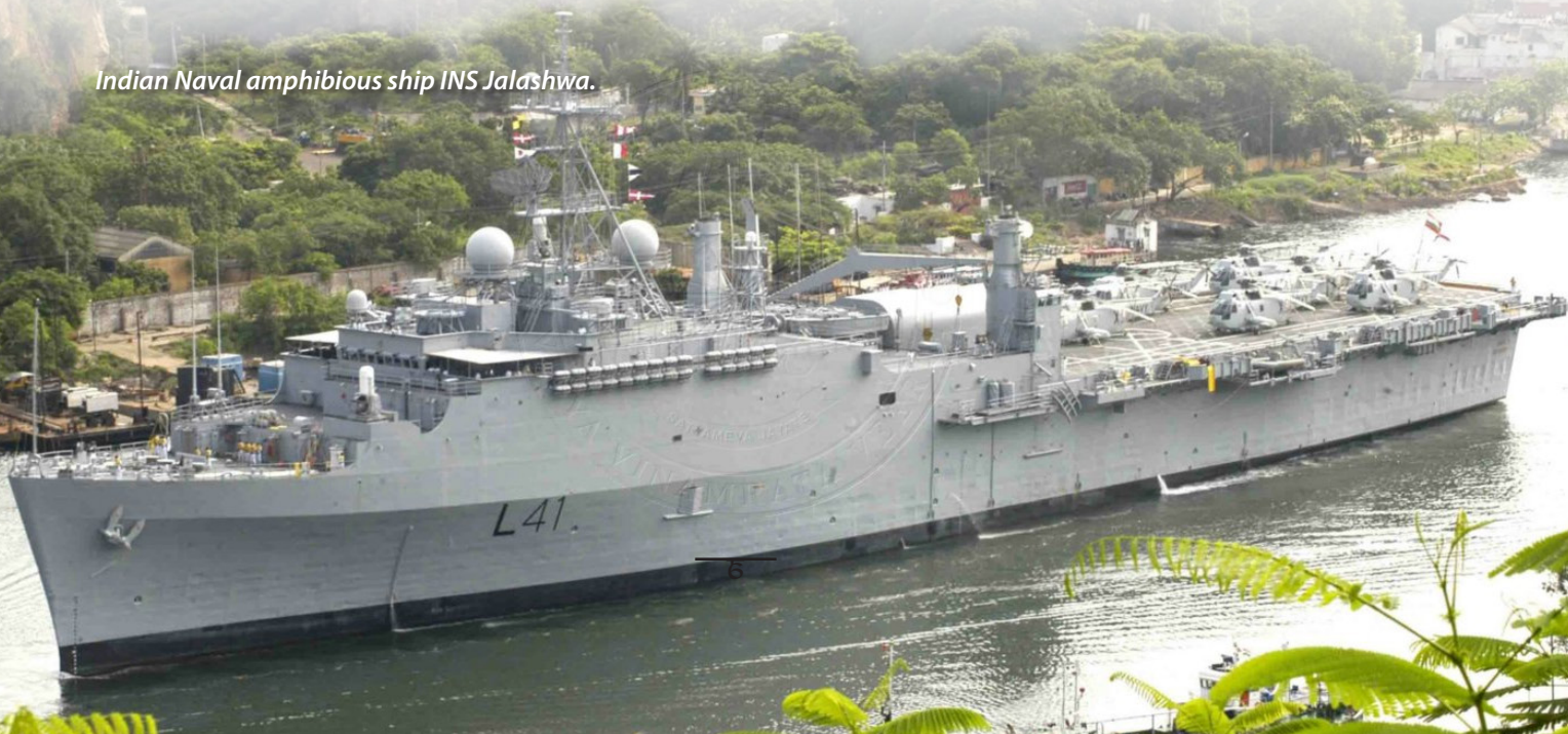
Indian Naval amphibious ship INS Jalashwa.

India intervened in the Maldives and Sri Lanka at the behest of the governments of these countries and was ready to do so in Mauritius in 1983 when the threat to the government there passed. India had airlifted 150,000 civilian workers from Iraq through Jordan during Gulf War I in what became known as the largest airlift after the Berlin airlift. Also, almost 5,000 civilian workers were evacuated by ship from Lebanon in 2006. After the 2004 South East Asian tsunami, 72 naval ships had set sail within three days to join international rescue and relief operations even though India's eastern sea board had itself suffered extensive loss of life and damage. For many years now, the Indian Navy has successfully participated in the multi-national naval effort to keep Somalian piracy at bay off the Horn of Africa.