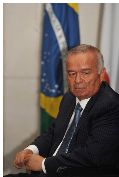
President of Uzbekistan Islam Karimov.

Within Central Asia, the effects of the U.S. withdrawal will be strongest in the Fergana Valley subregion. As mentioned above, the Fergana Valley is the strategic center of gravity of Central Asia, owing to its central geographic location, extremely fertile soil, dense population, strong religious influence, instability, and lack of effective control by central authorities. 14 Its territory is split between three states: Uzbekistan possesses most of the fertile valley floor itself, the Kyrgyz Republic holds the foothills and some major population centers, and Tajikistan controls the approaches. The international borders do not always follow traditional lines between ethnic groups in the region, adding yet another destabilizing factor. While the governments of Tajikistan and the Kyrgyz Republic have generally good relations, there are many local disputes in Fergana Valley border areas. The governments of Uzbekistan and the Kyrgyz Republic have poor relations, making regional cooperation more difficult. The valley's central location, ethnic diversity, and shared political status guarantee that any instability in the Fergana Valley will at least affect these three countries. It is