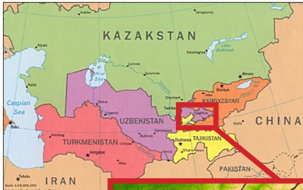
Central Asia political map by CIA . Inset elevation map of Fergana Valley by Aaron Perez with data from Gadm.org, Esri, and NGA [CC-BY-SA]