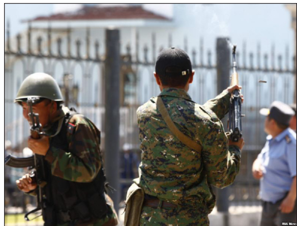
Kyrgyz law enforcement officers dispersed the crowd at a rally in Jalal-Abad at the building of the 'Friendship of Nations' University in May 2010.

After more than a decade at war, the world's most powerful military withdrew its combat forces from Afghanistan. Having variously pursued counterinsurgency and counterterrorism strategies, the invading force had not been victorious, but neither had it been defeated. The superpower left behind a friendly Afghan government and reasonably well-trained and well-equipped Afghan security forces. It also left behind insurgents, including not only local Afghans but also foreign Islamists, whose capabilities had been disrupted and degraded but not defeated. The superpower continued to support its Afghan government allies, rendering financial support, military training, and technical assistance to address the insurgency. However, after two years, new political and fiscal realities forced the superpower to cease its support. Afghanistan descended into civil war, in which Islamic extremists prevailed. In return for their support, the new Islamist government repaid its foreign jihadist allies with safe haven, which they used to train and plan attacks against the United States, among others. They also destabilized Afghanistan's neighbors, creating conditions in which violent extremism thrived. To the north of Afghanistan, violent extremist organizations focused their attention on the Fergana Valley, a region that lies at the heart of Central Asia and is shared by three states. 1