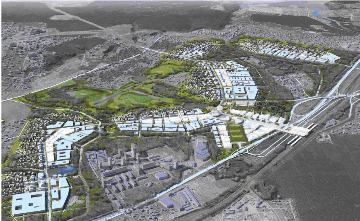
Figure 3 - Bird's Eye View of Skolkovo (Artist's Conception) 29