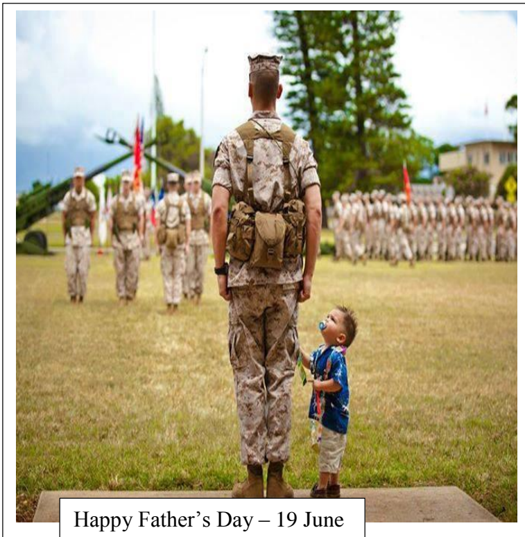
Happy Father's Day – 19 June