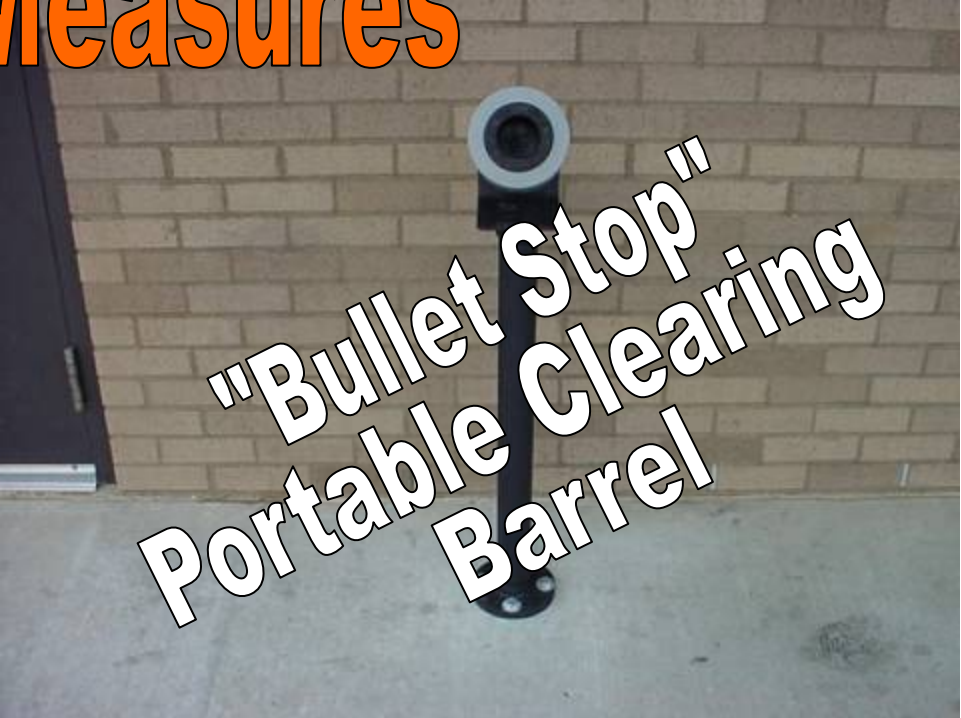
"Bullet Stop" Portable Clearing Barrel