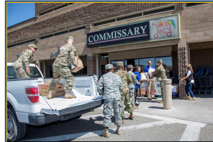
Soldiers load donated goods in preparation for delivery to Desert Manna

The Fort Irwin Feds Feed Families Food Drive was successful in collecting and donating over 1486 lbs. of food to our local food bank, Desert Manna of Barstow, CA. The USAG Fort Irwin in partnership with local units including the NTC HQs Operations Group, 11 th ACR, 916 th Support Brigade, DENTAC, and MEDDAC came together in the successful operation of the Feds Feed Families Food Drive event.