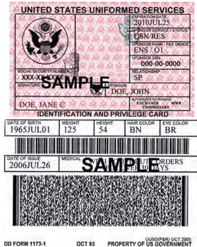
Figure 2. Military ID Issued to DoD Guard or Reserve Family Member