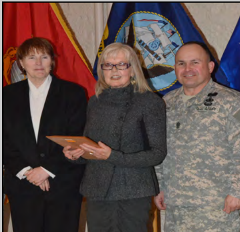
Lily Ledbetter's fight for equal pay led to new law