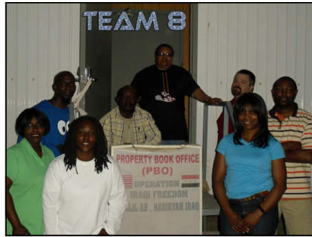
Theater Property Book Team #8