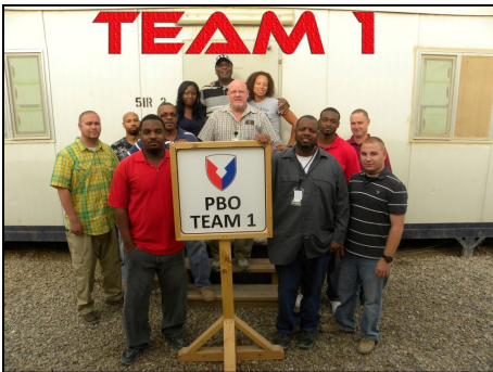
Theater Property Book Team #1