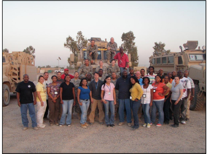
Joint Base Balad RPAT