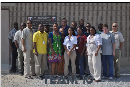
Theater Property Book Team #10