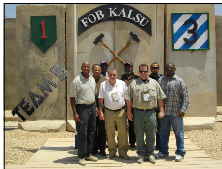
Theater Property Book Team #5