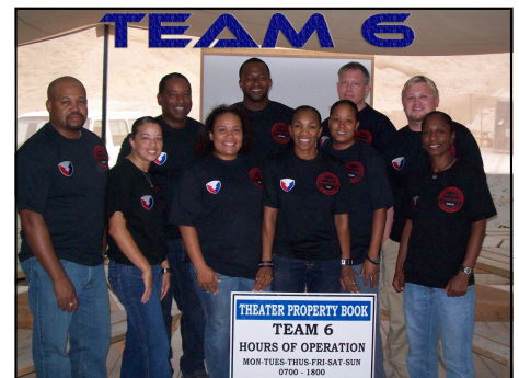
Theater Property Book Team #6