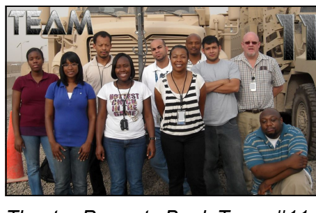
Theater Property Book Team #11