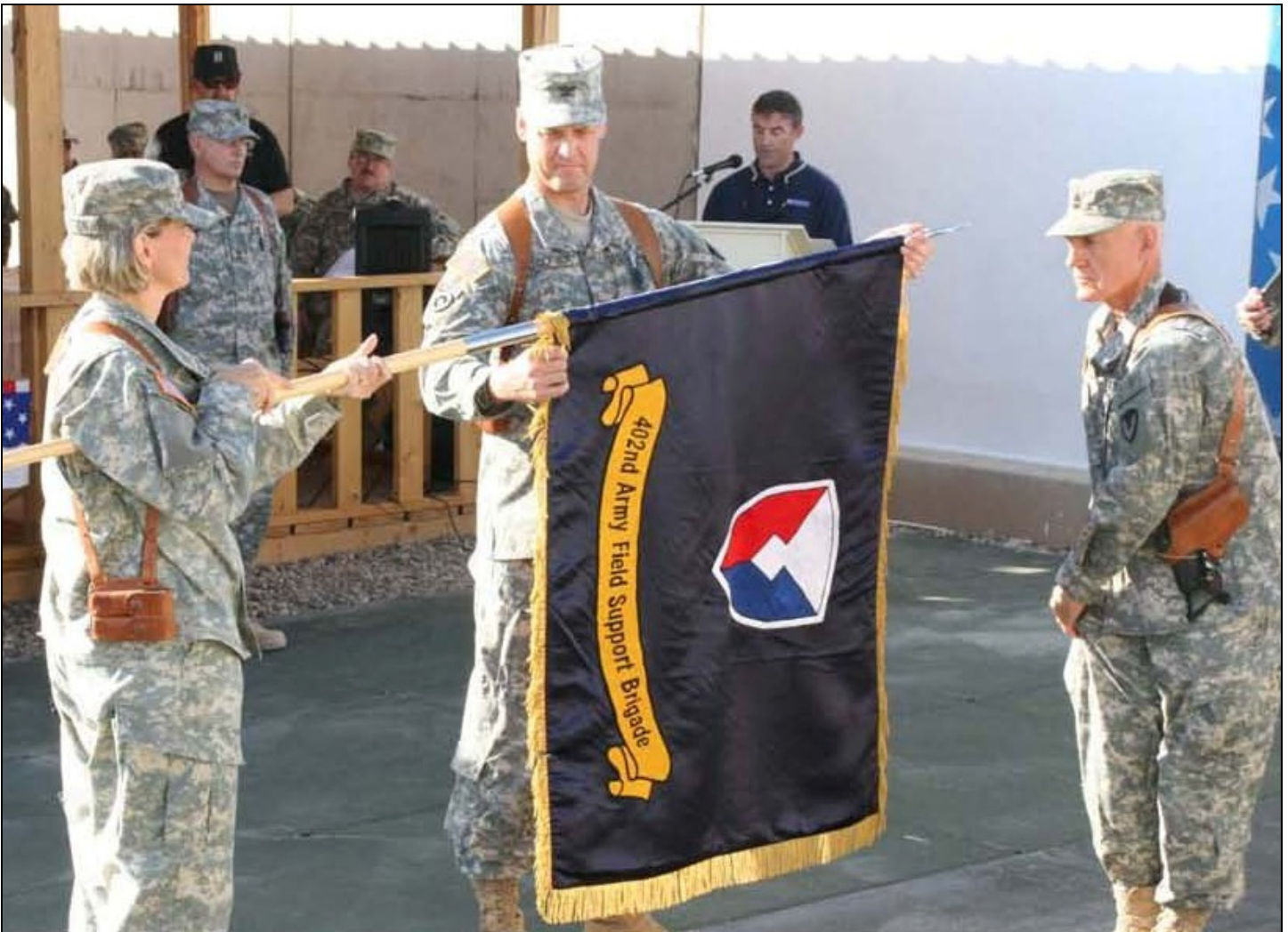
Uncasing the colors at the 402nd Army Field Support Brigade activation ceremony Oct. 7, 2006.