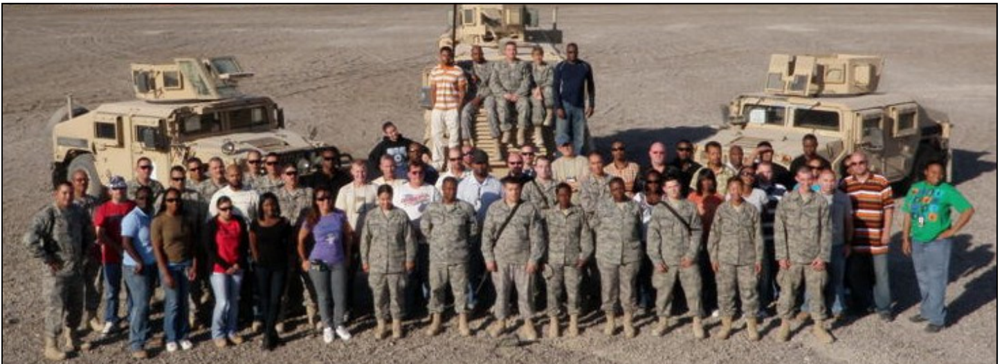
Victory Base Complex RPAT