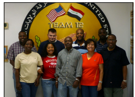
Theater Property Book Team #12