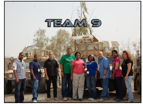
Theater Property Book Team #9