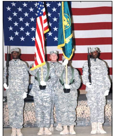
The color guard, comprised of Soldiers from the 2nd Battalion.