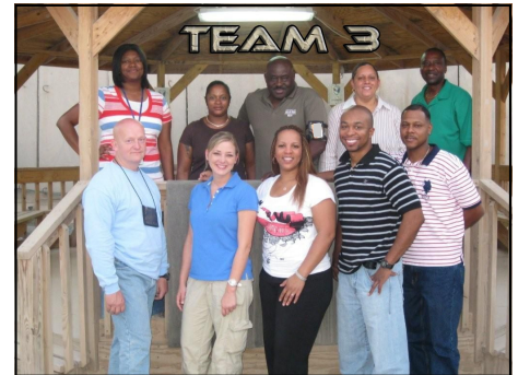
Theater Property Book Team #3