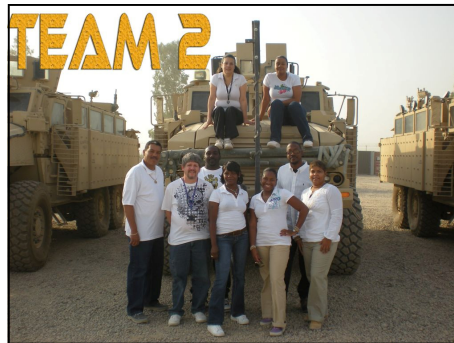
Theater Property Book Team #2