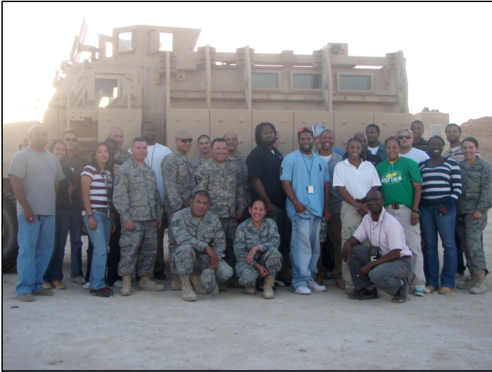
Al Asad RPAT