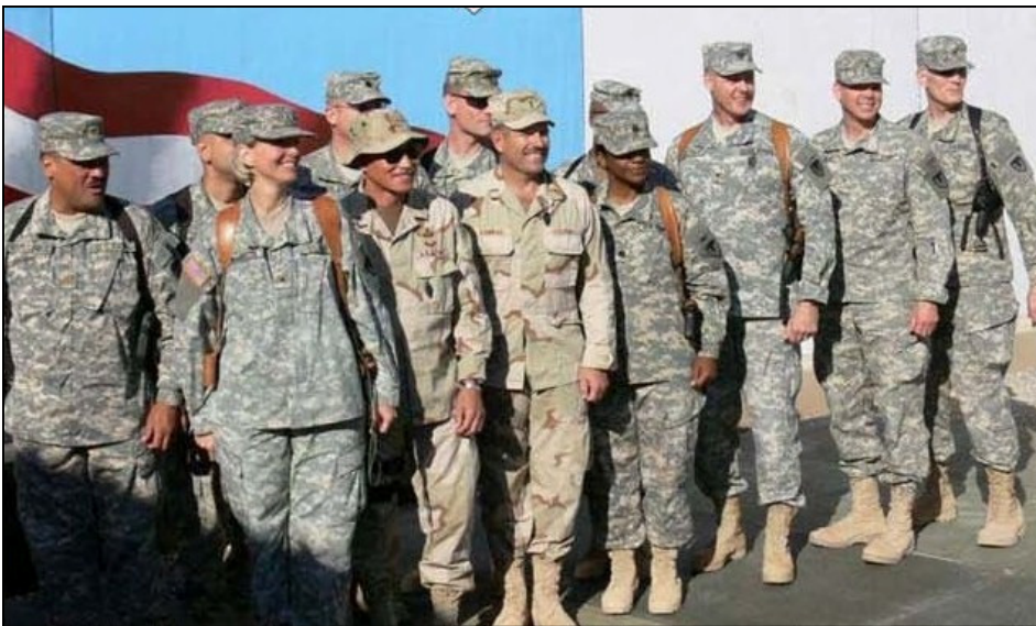
Leadership of the 402nd Army Field Support Brigade pose with Brig. Gen. McQuiston, AMC SWA commanding general 402nd AFSB activation ceremony, Oct. 7, 2006.