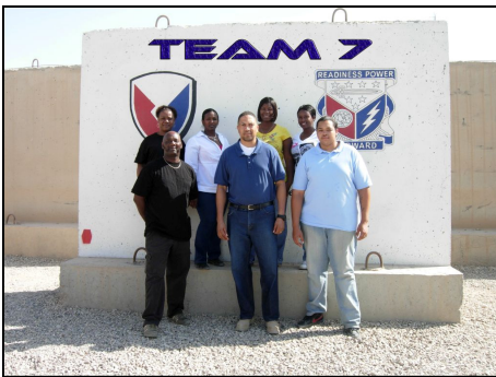
Theater Property Book Team #7