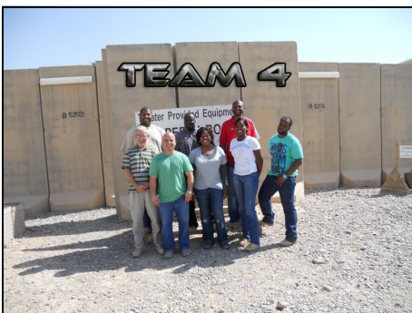
Theater Property Book Team #4