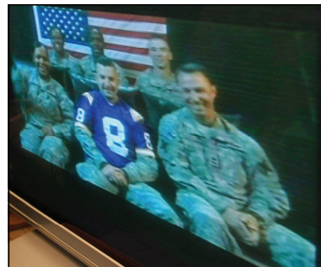
Participants appear on the studio monitor prior to “going live” inside Louisiana State University's Tiger Stadium during the Memorial Day weekend Bayou Country Superfest in Baton Rouge, La., May 31.

“It was really nice what they did for us. Somebody paid a lot of money for the satellite time so we could be a