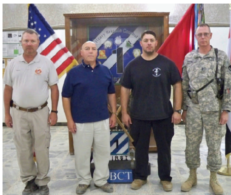
1/3 BLST TEAM MEMBERS