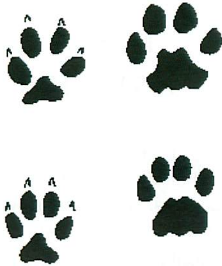
Dog vs. Mountain Lion Tracks