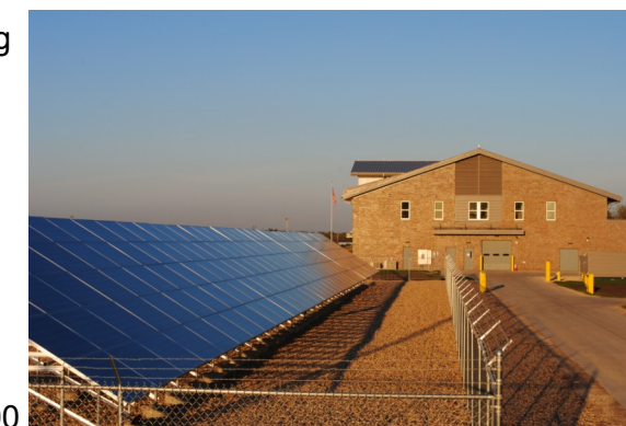
Solar panels at Joliet, IL, Army Reserve Training Center