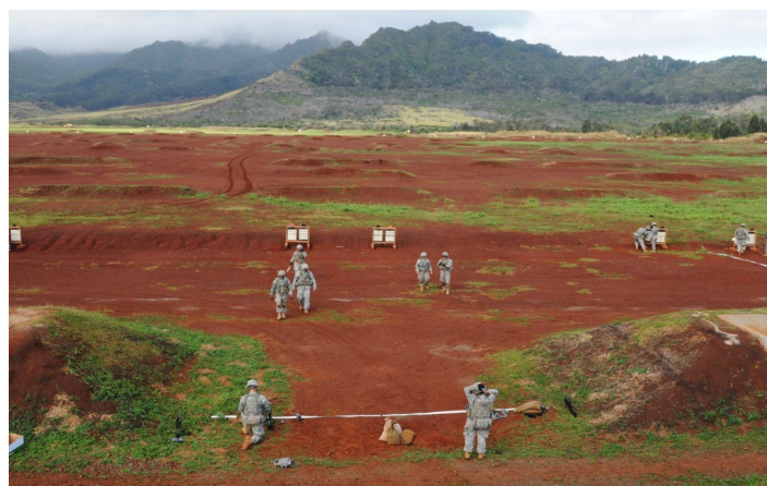
Hawaii Army National Guard Soldiers conduct pre-mobilization training at Schofield Barracks