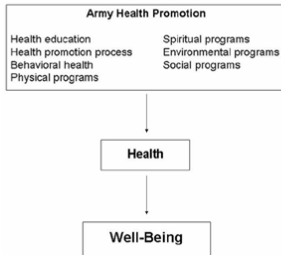
Figure 1-1. Health-related factors

(5) Environmental and social programs. Figure 1-1 illustrates the relationship between the functional areas of Army health promotion and individual health and well-being.