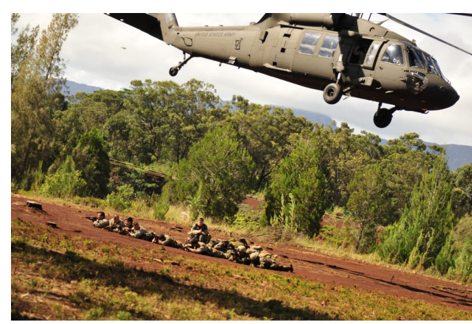
Soldiers provide security for a Black Hawk helicopter during jungle operations training at Schofield Barracks, HI.

REEOs protected military training and testing operations by working with state legislators and regulators to ensure unique military needs will continue to be met in a sustainable way.