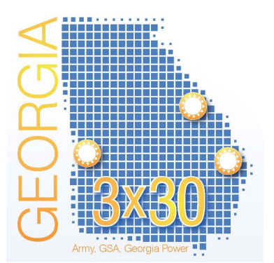
"Georgia 3X30" solar power project may be Army's largest to date. (U.S. Army, Georgia Power)

SUSTAINING READINESS IN PARTNERSHIP WITH STATES