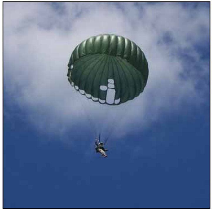
2nd Squadron, 152nd Cavalry (R&S) of the 219th BFSB, Indiana Army National Guard in preparation for Operation Tecumseh Rage.

"The business of information gathering on a near