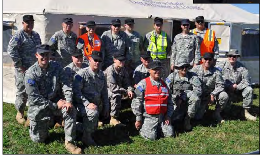
The Indiana Guard Reserve conducted annual training in October 2015. This training included search and rescue and physical training. However, a first-time event took center stage. The IGR medical command teamed-up with the Indiana State Department of Health to train on a setting up a portable field hospital.