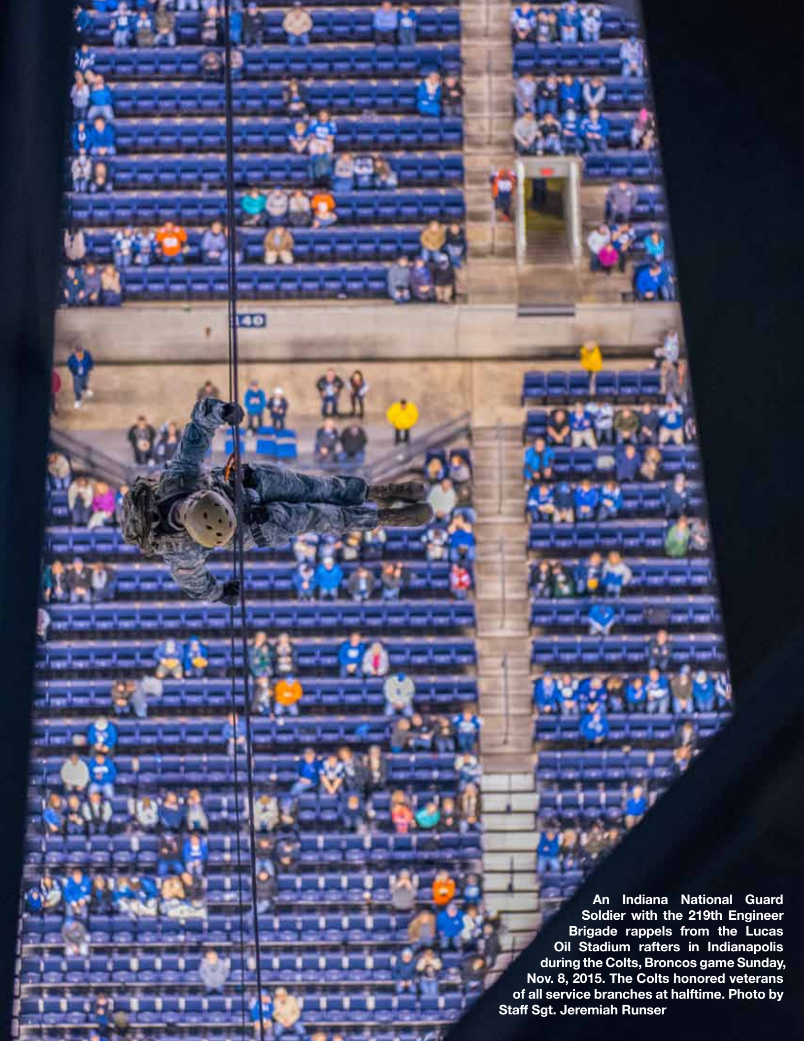
An Indiana National Guard Soldier with the 219th Engineer Brigade rappels from the Lucas Oil Stadium rafters in Indianapolis during the Colts, Broncos game Sunday, Nov. 8, 2015. The Colts honored veterans of all service branches at halftime.